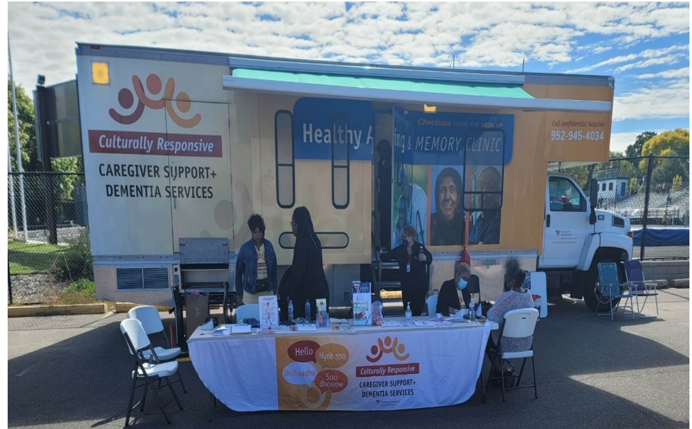
(188) Aging and Memory Mobile Clinic promo - YouTube